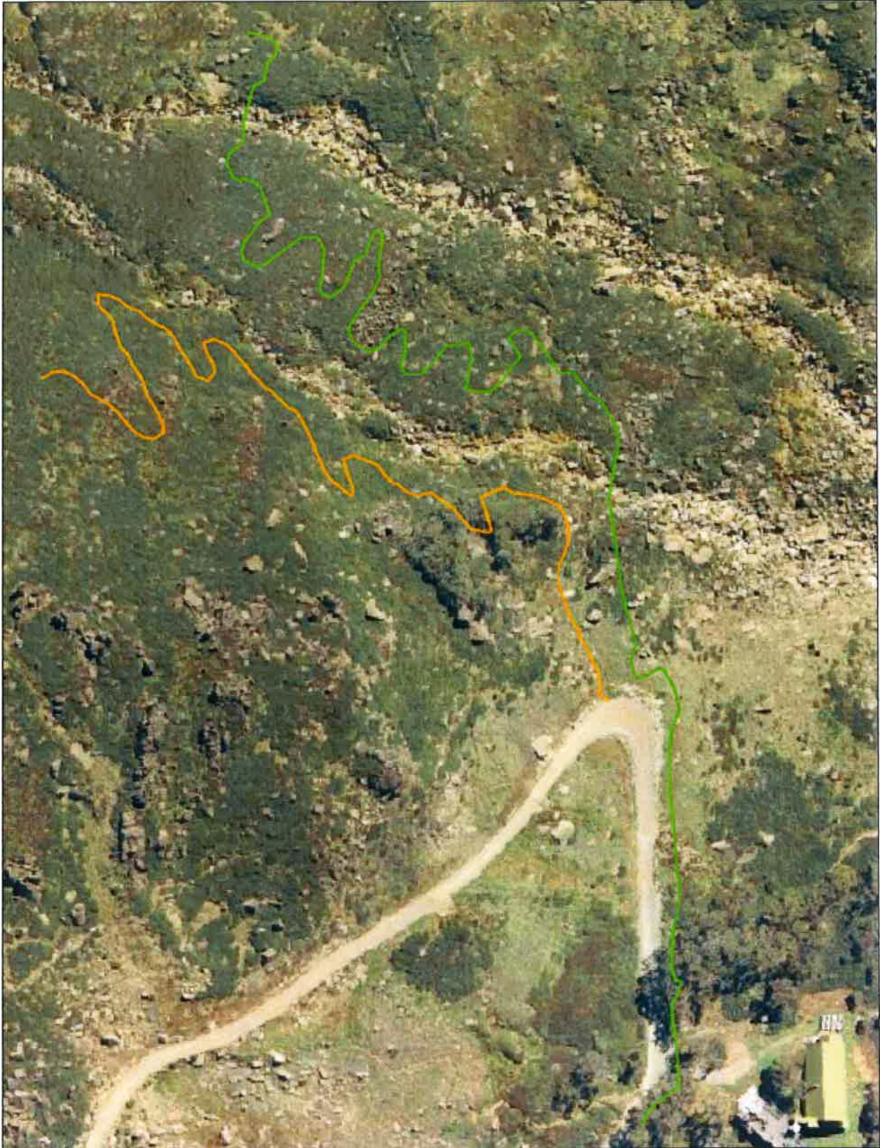
Figure 3: Proposed alignment of mountain bike trail (green line) compared with approved alignment (yellow line) (Source: Applicant's MOD documentation)