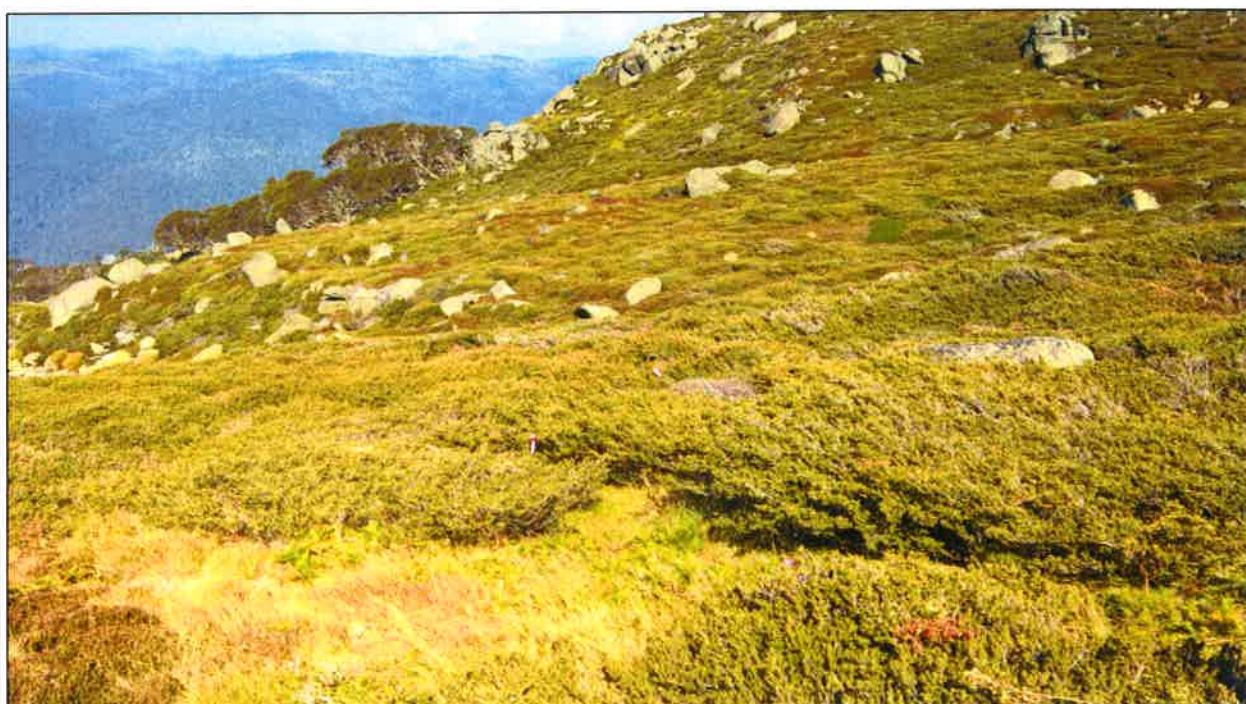
Figure 2: Start of new alignment of Trail 12, noting the approved Trail 12 alignment was located on the opposite slope

The alignment of proposed Trail 12 is shown at ( Figure 3 ).